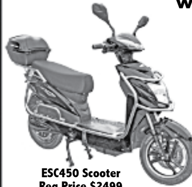
ESC450 Scooter Reg Price $2499 NOW $1200