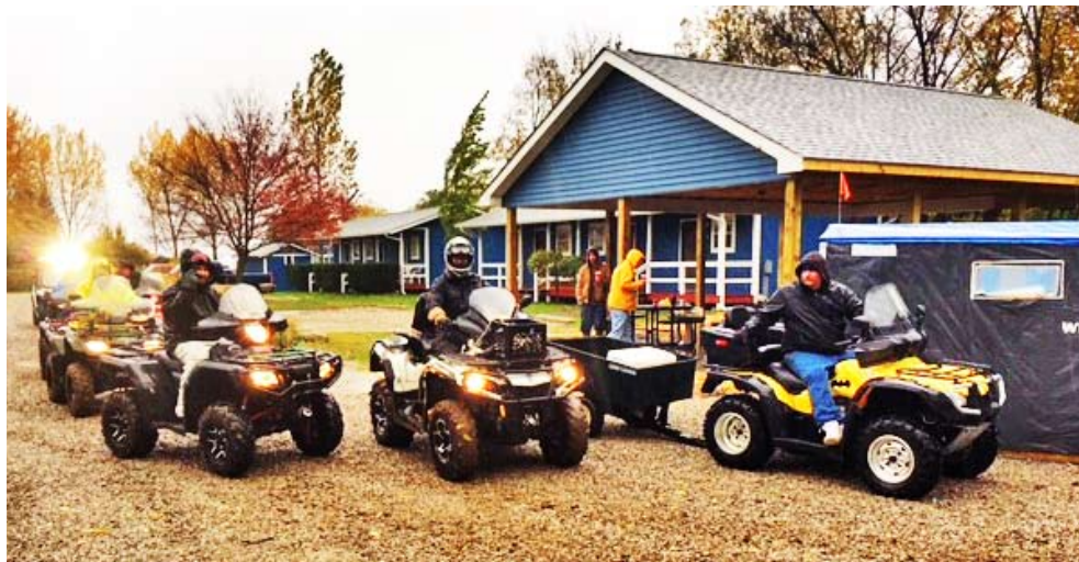
ABOVE: These ATV riders paraded around the island on Thursday, November 1st, to begin the six-month season for allowing these kind of vehicles to use island roads. They are seen here at the new pavilion at the Bird's Nest getting ready to parade. The group ended up at Tipper's.

Thanks to all for a terrific 2018 season! See You in the Spring!