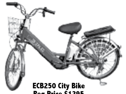
ECB250 City Bike Reg Price $1295 NOW $695