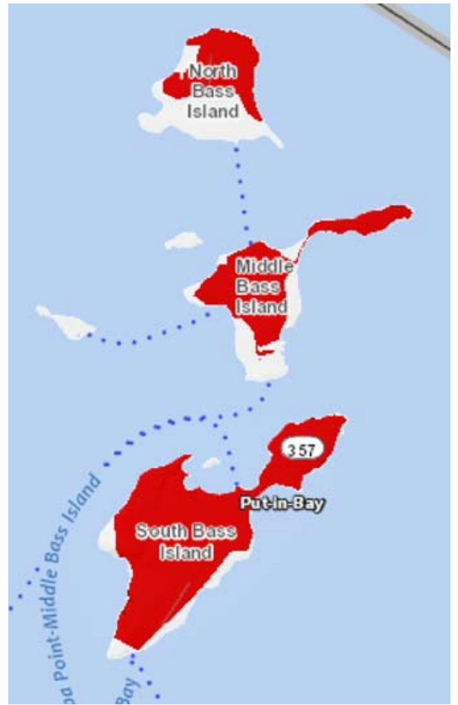
ABOVE: This map from the Internet shows Verizon's cell phone coverage on the islands. The red is the covered area, and the white is the non-covered area. Check the map over and see if you agree or disagree. We showed this to an islander who said, "If the Gazette had a 'Joke of the Month' in the paper, this would certainly qualify."

trospetion (if that is possible). I realized that my preoccupation with beach glass seems to be at the root of most of my transportation troubles. I always end up a day late (but never a dollar short) when it comes to Middle Bass. Like pilot fish to a shark, I like to stick to Middle Bass (and flit about her gills).