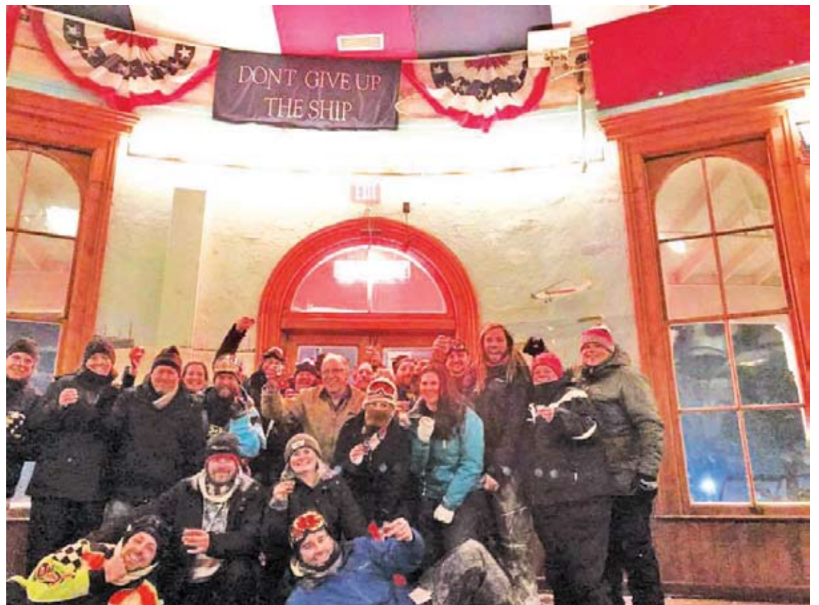
ABOVE: What's better than stopping at the Round House after riding around in a winter storm on your ATVs? This group surely enjoyed the stop last month with this rare mid-winter photo of the interior of the popular watering hole in the heart of Put-in-Bay. Sorry, but Mad Dog was not on hand to entertain.